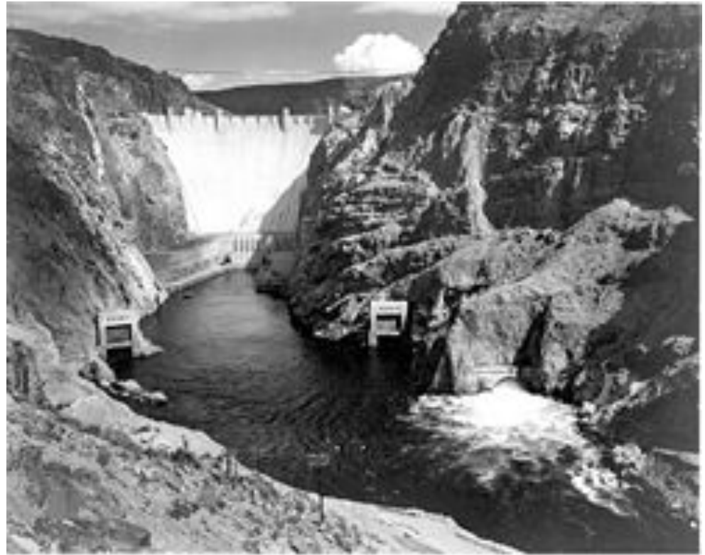
Hoover Dam 1931 - 1936